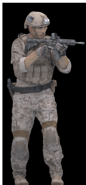
Figure 1 - Renderings of the Full Bodies point clouds. On the left is longdress and soldier is on the right.

This data set can be found at: https://jpeg.org/plenodb/pc/8ilabs/ .